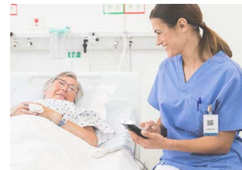
Bedside care: single-entry vitals registration to EMRs/EHRs without leaving the patient.

An Ascom Myco 3 solution makes available a wide spectrum of up-to-date clinical information.