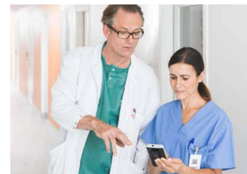
Communicate and coordinate effectively. Requests, messages and tasks go directly to assigned recipients.