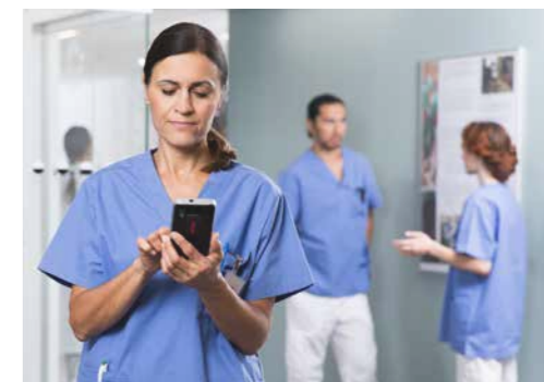
Lets clinicians access and share lab results, images, requests and alerts while on the go.